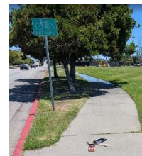
My keys !!