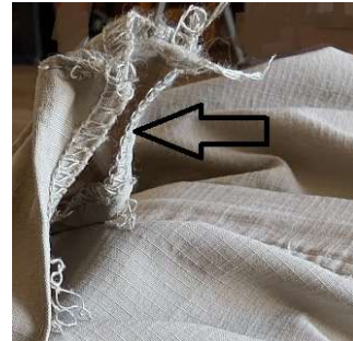
The torn pocket

ground somewhere. I walked with my eyes focused on every slab of sidewalk cement and every bit of turf growing alongside. Block after block I went, finding nothing. Upon reaching the pedestrian overpass of the bridge on Foster City Boulevard, I began to fear the possibility of my having dropped the keys on that narrow pathway, from which they might have fallen into the lagoon! There were no keys to be found there, but as I descended from there to the dog park area, that fear of Davy Jones' locker housing my keys continued to grow.