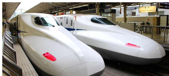
An image of the Shinkansen , the Japanese bullet train system

Question: "Bullet" trains are almost commonplace in various parts of the world - except in the U.S. What can you tell me about bullet trains? (Where are they? What speeds do they attain? Are they comfortable?, etc.) Are they considered good for the environment? -- Jerry