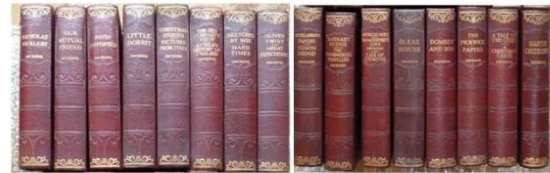
An assortment of titles by Charles Dickens

Question: A friend recently sent a link to this excellent site of illustrations used in Charles Dickens' novels: