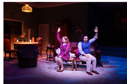
Writing Fragments Home