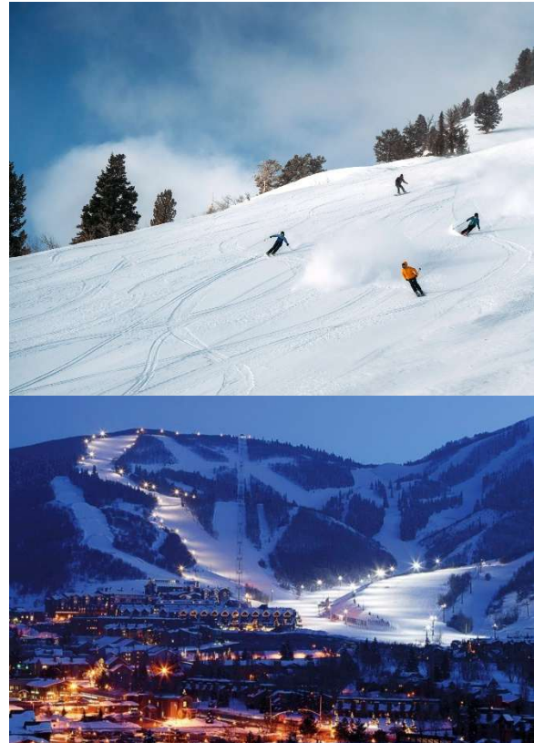
Two pictures of ski resorts in Utah

Question: Can you compare skiing in California to Utah? What are the best/(worst?) features of each state's resorts? -Jerry