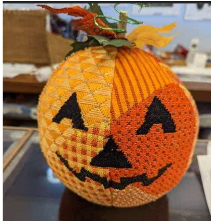
Eve's recently completed needlepoint masterpiece: a present for the grandkids